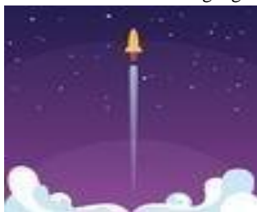
Logo of Memrise

Memrise helps the learners to increase English vocabulary in a systematic way. One can easily download this app in any android based instruments and can easily access this app in an effective way. One of the noticeable merits of this app is that it can also be used on offline mode. Once, this app is downloaded in any android based instrument, one can use this app for life time. There is no need of internet after downloading this app. Thus, a learner can easily download this app from the play store of their instruments. At the time of downloading this app, one must have internet connectivity in their instruments, for further of frequent use of this app, there is no need of internet connectivity. Memrise also have courses to learn the English Grammar in an innovative way.