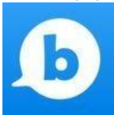
Logo of Busuu

Busuu, an app which is designed on the CEFR language framework. In this app, various vocabulary, lesson dialogues, writing practice etc. are taught in a funny way. The learner gradually advances the next step of the various lessons as he passes the last stage of each lesson. It is also free android based app so learners can easily download this app in any android based instrument and can learn English in a very easy and funny way. Teachers give assignment to their students to learn vocabulary, dialogue writing, role-play, group discussion etc. With Busuu, one can talk with native English speakers to practice English speaking and it's a great way to practice your speaking.